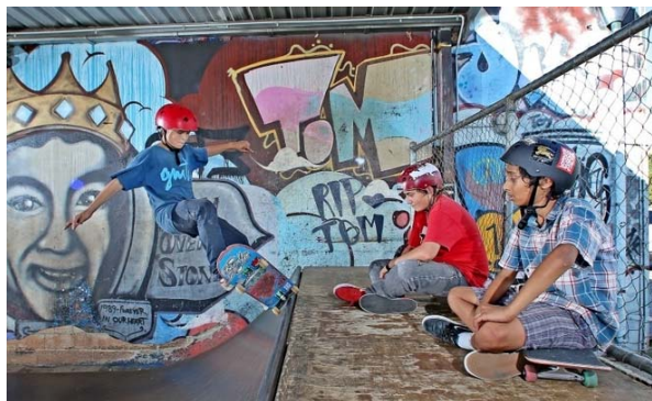
The West Australian

They are a popular target for community suspicion, but research has found teenagers frequenting their local skate park may be unfairly stereotyped.